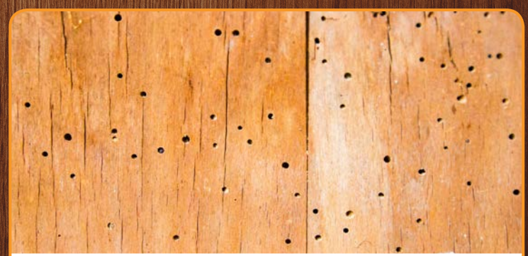
Allgon Timber Treatment is extremely effective in the treatment of borer infestations in timber floor boards, when spray applied at recommended rates.